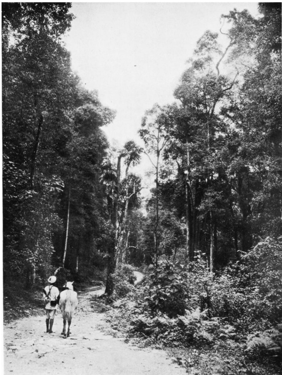
FOREST NEAR DARJILING