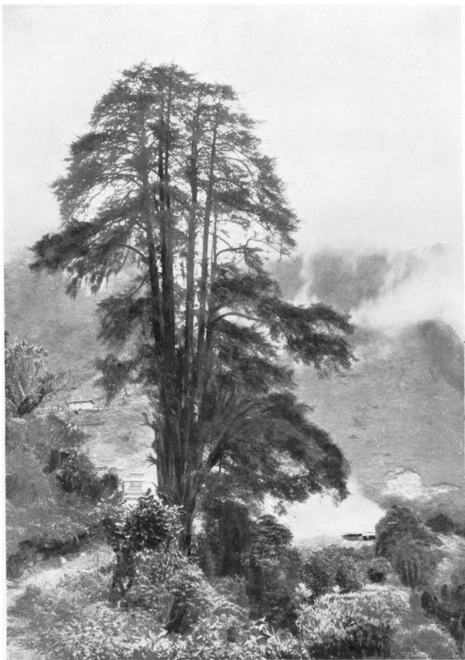
LARCHES NEAR LACHEN, SIKKIM